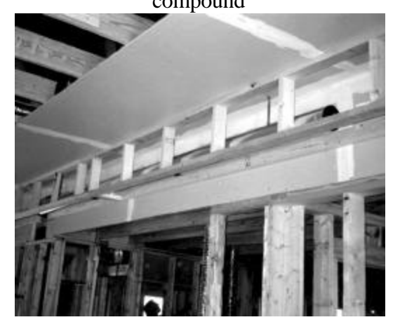
Figure 8 Chase along wall of open living area. Note chase sealing with drywall compound

The top of the chase should be uninterrupted by framing. Miscellaneous bracing that interrupts the upper air barrier creates additional cutting, fitting, and sealing work. In most cases, the air barrier will be made of an air-tight material (e.g. drywall, rigid insulation) sealed at the edges and seams, and the thermal barrier will be ceiling insulation installed over the top of the chase, plus the sides for fur-ups.