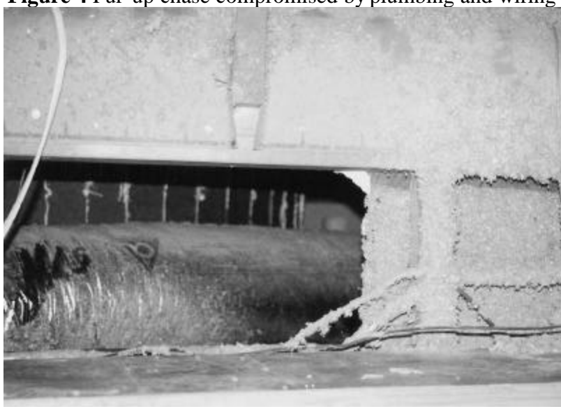
Figure 4 Fur-up chase compromised by plumbing and wiring

Fur-down chases. Chases built down into the conditioned space generally occupy the upper portion of hallways, run along walls, and/or cut across open living areas as architectural elements (Figure 5). The lowered ceiling height can be offset by widening the hallway and can be used to define living spaces in open floor plans. Most of the houses included in this field study featured fur-down chases.