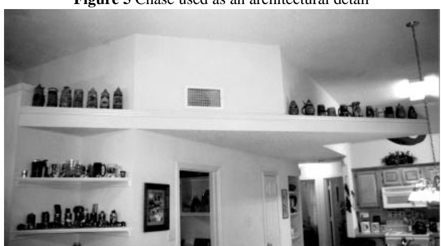
Figure 5 Chase used as an architectural detail

A standard definition for "conditioned space". The "conditioned space" is defined by the location of the air barrier and thermal barrier. The air inside these barriers is cycled through the air handler and conditioned . To be in the conditioned space , the duct system must be isolated from all adjacent unconditioned spaces (including wall cavities) by a continuous air barrier and be within the thermal barrier of the house. The benefits, both thermal and air exchange, of interior duct systems will be severely diminished if not completely lost without these barriers.