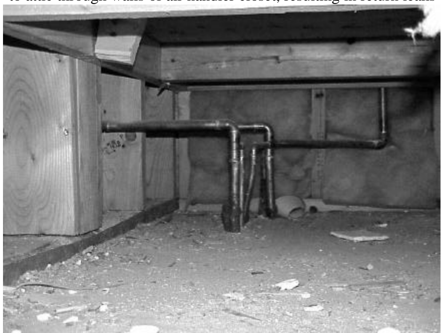
Figure 12 Conventional platform return. Rough framing connected to attic through walls of air handler closet, resulting in return leaks

Protecting the chase after completion Protect chase from cable, phone and other installers who may want to use it as a convenient way to run wires. The holes that typically result will compromise the air barrier (Figure 13). Identifying the chase as a space intended to be separate from surrounding unconditioned spaces is difficult at best. The authors have not yet seen a consistently effective method. Communication is again an important factor.