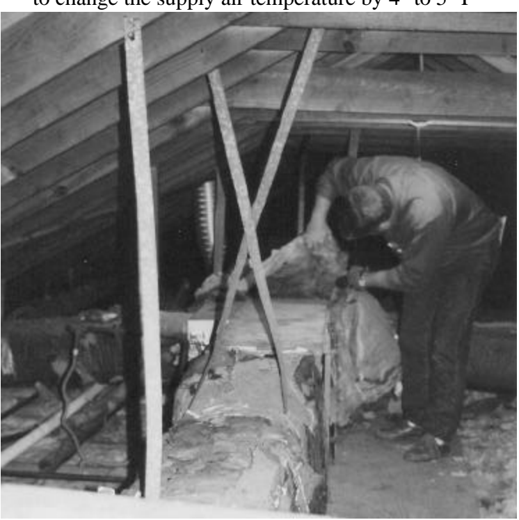
Figure 1 Leaky ducts in unconditioned spaces cause unbalanced air flow and can gain or lose heat sufficient to change the supply air temperature by 4<sup>0</sup> to 5<sup>0</sup> F