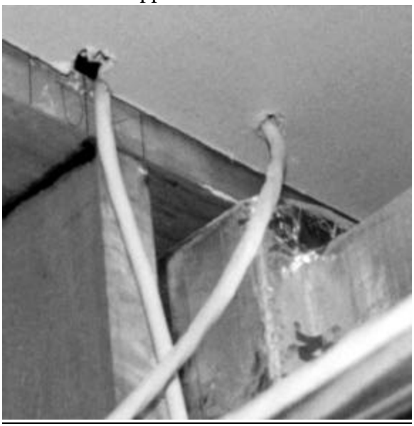
Figure 13 Holes for wiring, plumbing, cables, etc. need to be sealed with a code approved sealant

notices should advise the installer to seal any penetrations to drywall made from unconditioned spaces. Though this should be standard practice and is often required by code, virtually all services installed post-occupancy are never inspected.