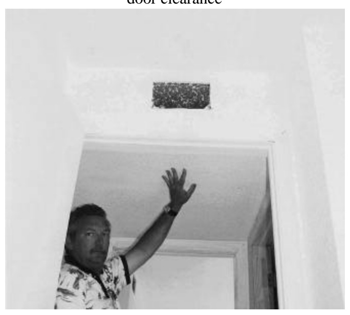
Figure 6 Chase in hallway, note 7'0" ceiling and door clearance

Usually, ceiling heights cannot be less than 7'0" to meet code and allow for door framing (Figure 6). For homes with 8' ceilings, that allows 12"or less for the ducts and the structure of the chase. To minimize the space needed for chase structure, detail the smallest available framing member that will support the weight of the drywall (for the bottom of chase) and ducts (if not supported by straps). This might be 2 x 2s or light gauge metal framing.