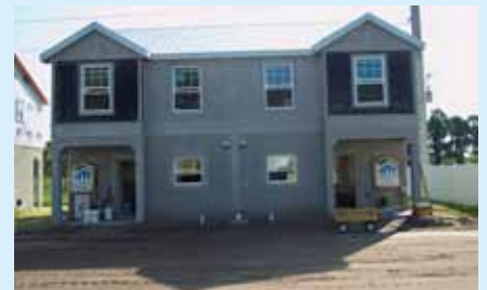
Energy ratings improve energy efficiency and promote better building practices for Habitat affiliates.

In addition to new home construction, Calcs-Plus also provides free ratings on existing homes for the affiliate. South Sarasota Habitat purchases these homes as part of the HUD Neighborhood Stabilization Program (NSP). Part of this program is improving energy efficiency through the use of high performance retrofits.