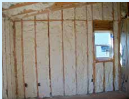
Upstairs insulation strategy: R-21 open cell spray foam insulation on 2 x 6 frame walls and under roof deck