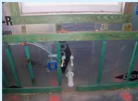
Downstairs insulation strategy: Continuous foil faced rigid insulation on concrete block