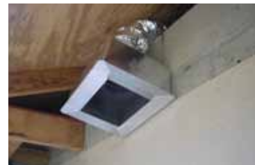
Outside Air Ventilation