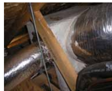
Refurbished Duct System