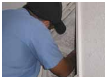
Duct System Sealed and Tested