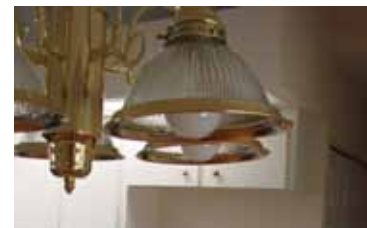
Compact Fluorescent Lighting